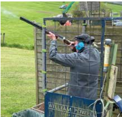
Above & right: Participants enjoyed the Midlands Clay Pigeon Shoot on 27 April, despite some rather challenging targets